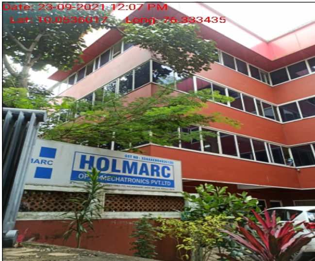
Physical Location: Outside of the Firm