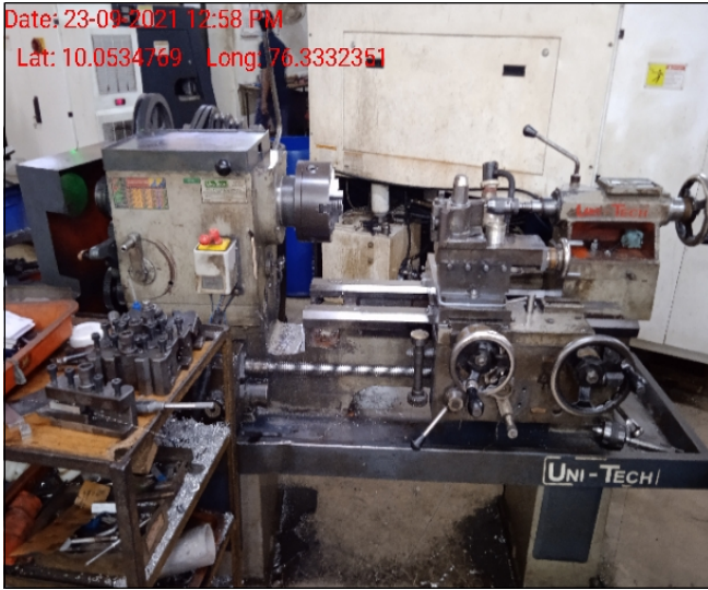
Critical Machine for Production

Date: 23-09-2021 12:58 PM Lat: 10.0534769 Long: 76.3332351