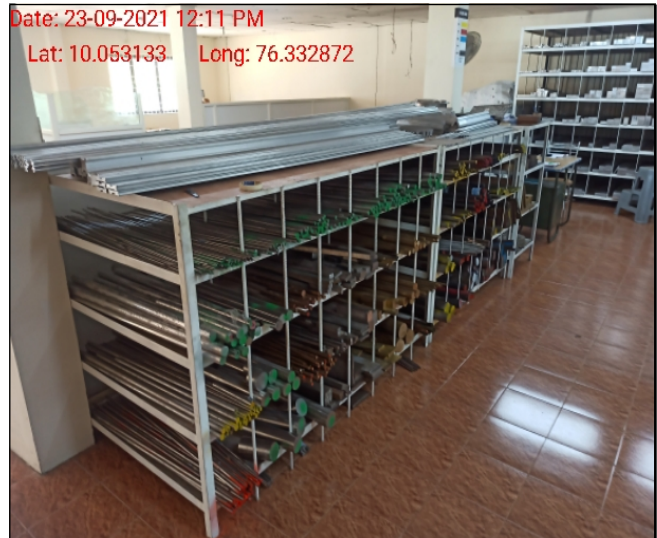
Raw Material Stock