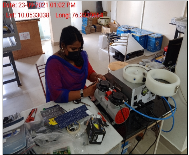
Quality Check Process

Date: 23-09-2021 01:02 PM Lat: 10.0533038 Long: 76.3329584